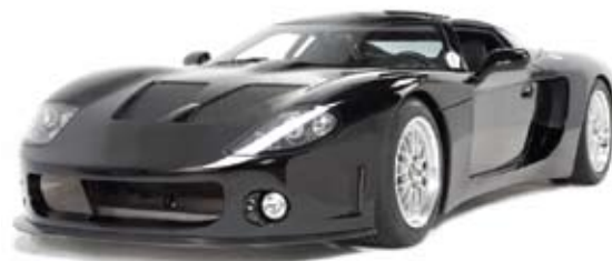
CMT-380 Concept Car

The CMT-380 is the world's first microturbine-powered supercar. This sleek hybrid-electric sports car draws its power from lithium polymer batteries and a Capstone C30 microturbine. The CMT-380 proves that a plug-in hybrid can deliver the driving experience of a high-performance supercar and achieve extremely high fuel economy, reduced greenhouse gas emissions and ultra-clean vehicle emissions.