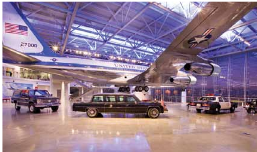
Sixteen Capstone C60 microturbines running on natural gas provide electricity for the Air Force One Pavilion.