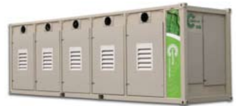
C800 800kW Power Package